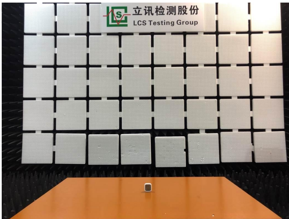
RF Electromagnetic Field (80MHz to 6 000MHz )