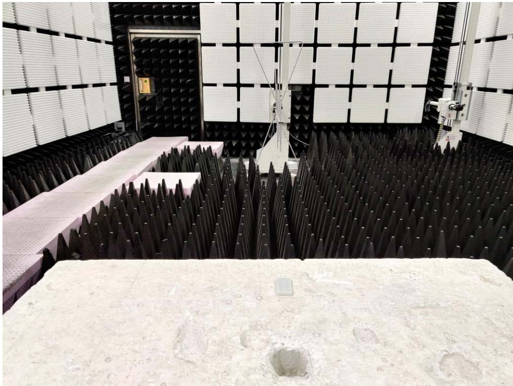
RF Electromagnetic Field (80MHz to 6 000MHz )