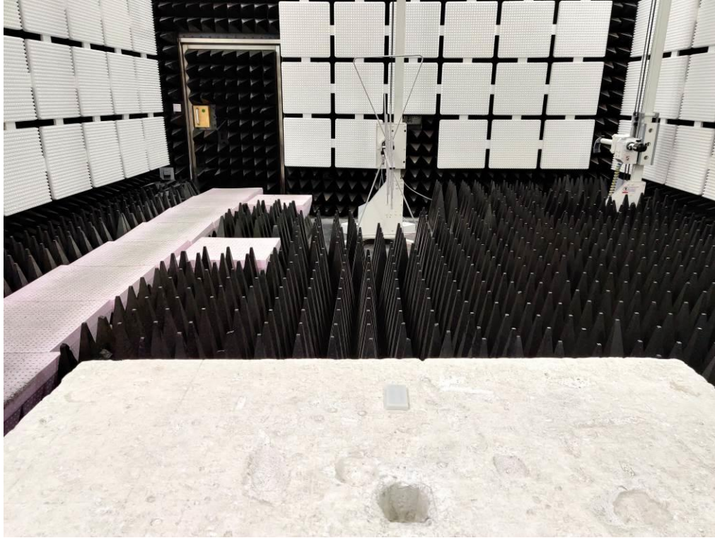
Radiated Emission Below 1 GHz